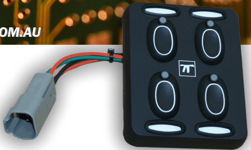
Part No. DSS-PK400

Icons shown on this keypad are for visual demonstration only.