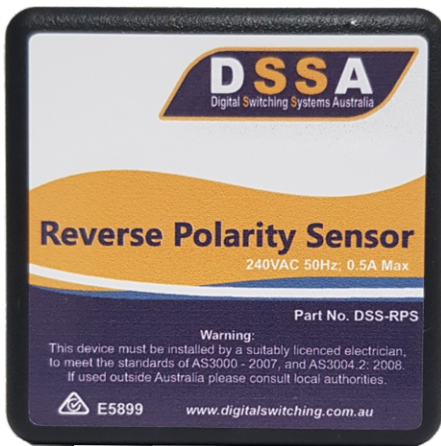
Part No. DSS-RPS